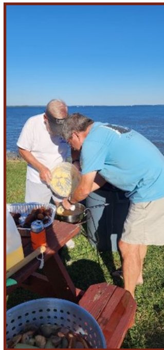
D Pier Volunteers We Need to Heat This Up