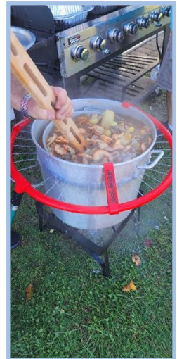
Wasting Away in D Pier Partyville Smell of a Shrimp Pot Beginning to Boil