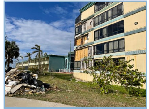
Punta Gorda Waterfront Hotel After Ian