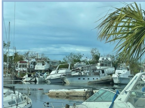
A Sight no Boater Ever Wants to See