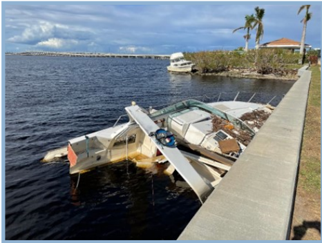
Derelict Boats a Month after Ian Punta Gorda Waterfront