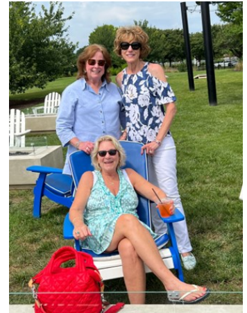
BYC Cruisers At Bay Bridge Marina