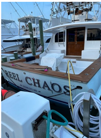
Spotted in Ocean City A Impostor?