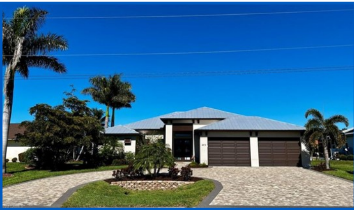
Carnaggio's Winter Hideaway Cape Coral, FL